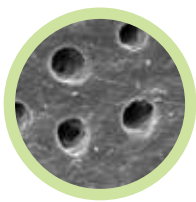
Electron Micrograph Showing Open Dentine Tubules

When included in toothpaste formulations, BioMin F adheres to tooth surfaces and slowly dissolves to release calcium, phosphate and fluoride ions over an 8-12 hour period to form acid resistant fluorapatite (tooth mineral). This is much more effective than conventional toothpastes where the active ingredients, including soluble fluoride, are washed away and become ineffective less than two hours after brushing. At the same time BioMin F helps reduce tooth decay and promotes healthy tooth structure.